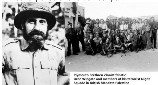
Plymouth Brethren Zionist fanatic Orde Wingate and members of his terrorist Night Squade in British Mandate Palestine

"The Jews are loyal to the Empire... Palestine is essential to our Empire- our Empire is essential to England- England is essential to world peace. We have the chance to plant here in Palestine and Transjordan a loyal, rich and intelligent nation, with which we can hold for us the key to world domination without expense or effort on our part."