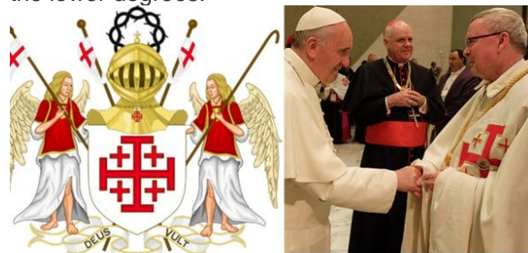
Grandmaster Cardinal Edwin O'Brien of the Equestrian Order of the Holy Sepulchre with Pope Francis (named after the ecologist gnostic saint Francis of Assisi. At left: the order's Templar logo)

According to the sect's website , the Knighthood of the Holy Sepulchre is devoted to “absolute fidelity to the Popes” and seeks to “sustain and aid...the Catholic Church in the Holy Land.” In Freemasonic fashion, the Order is organized around a Grand Master and a chain of command of obedience down to the lower degrees.