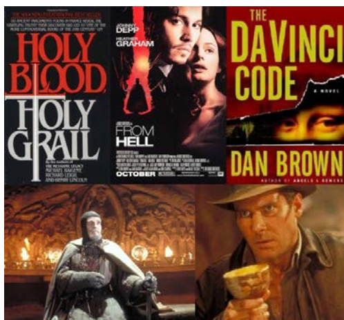
Just a few samples of the pop culture artifacts that have banalized real insane things which the Gnostic mystery cults shaping world politics actually believe in

It is also worth noting that author Michael Baigent—who wrote Holy Blood Holy Grail , which informed Dan Brown's Davinci Code — was also a member of the Quatuor Coronati Lodge .