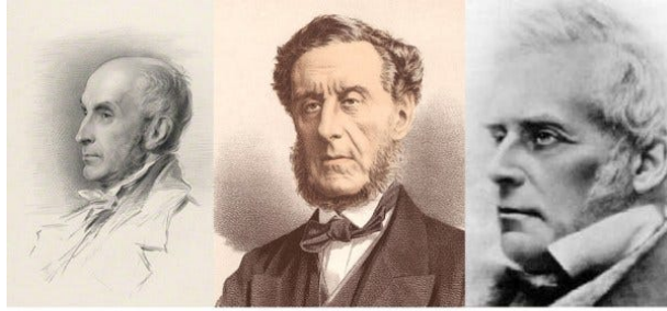
Left to right: Henry Drummond, Anthony Ashley Cooper (7th Earl of Shaftesbury) and John Nelson Darby

Shaftesbury, and 3) John Nelson Darby (founder of the 'Exclusive Brethren' Plymouth Brethren and leader of the sect).